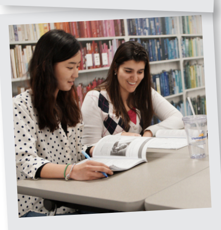
Extra study resources